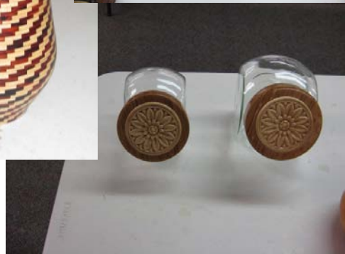
Pieces from show and tell and the challenge.