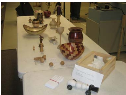
February Show & Tell Table